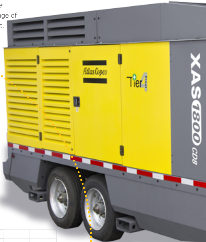
Variable Flow and Pressure (Operating range)

The all new XAS 1800 CD8 has extended its operating range, over the iT4 model, allowing up to 200 psi making it the most versatile machine its class. The variable flow and pressure allows for operation in a wider range of applications. Specifically for rental customers this increases the applications where the machine can be used increasing fleet utilization and ROI.