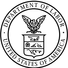
U.S. Department of Labor